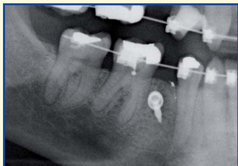
An X-ray showing a mini-screw placed between the lower teeth