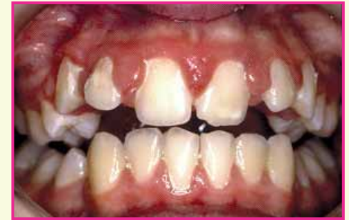
Damage caused by the brace due to sugary snacks/drinks and poor brushing.

Sugary snacks/drinks and poor cleaning of your teeth and brace will lead to permanent damage to your teeth as shown in the picture below.