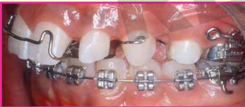
A removable brace on the top teeth and a fixed brace on the bottom teeth.

Your speech will be different at first. Practice speaking with the brace in place e.g. read out aloud at home on your own. In this way, your speech will return to normal within a couple of days. To begin with you may produce more saliva and have to swallow more than normal. This is quite normal and will quickly pass in a couple of days.