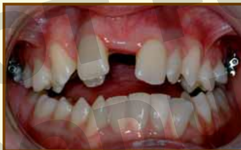
After widening complete