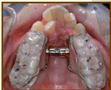
RME with plastic splint

The metal framework contains an expansion screw in the middle to widen the upper jaw. It is attached to metal bands cemented on the back teeth or to a plastic splint which is cemented firmly to the back teeth.