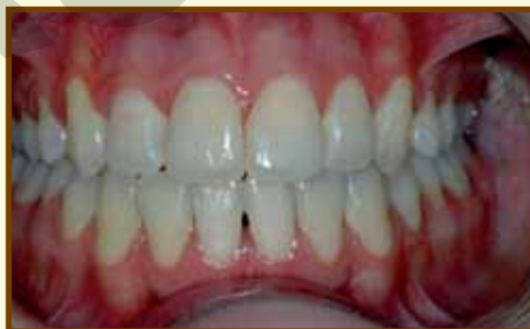
The final result after RME and fixed brace treatment