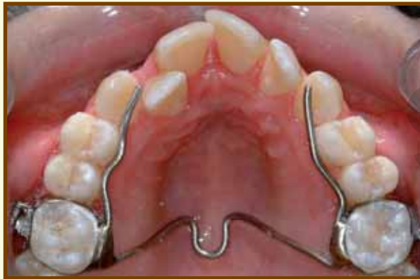
Fixed brace maintaining expansion

The RME will have to be worn all the time for a period of 3-9 months. During the first 2-3 weeks, you will be adjusting the RME to make the upper jaw bone wider. In the remaining months it is left alone to allow new bone to fill in the gap under the gum between the two halves of the upper jaw. After arch widening is complete, a fixed brace is fitted to maintain the width of the upper jaw.