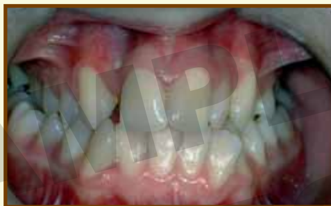
Start of treatment

As the RME widens the upper jaw, a temporary gap often appears between the two front teeth. Don't worry about this as it will close later during treatment.